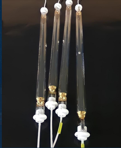
UV lamp+Quartz Sleeve